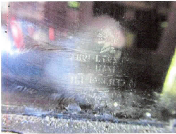
[Empty rectangular box]