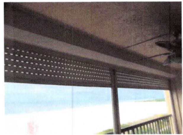
[Empty rectangular box]