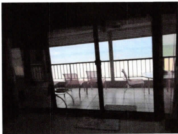
[Empty rectangular box]