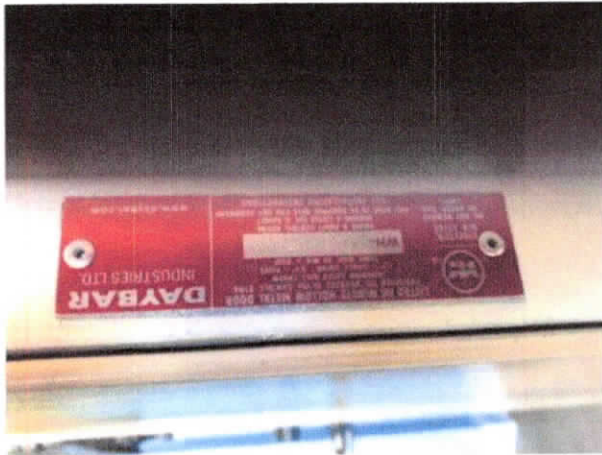
[Empty rectangular box]