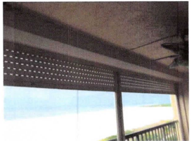
[Empty rectangular box]