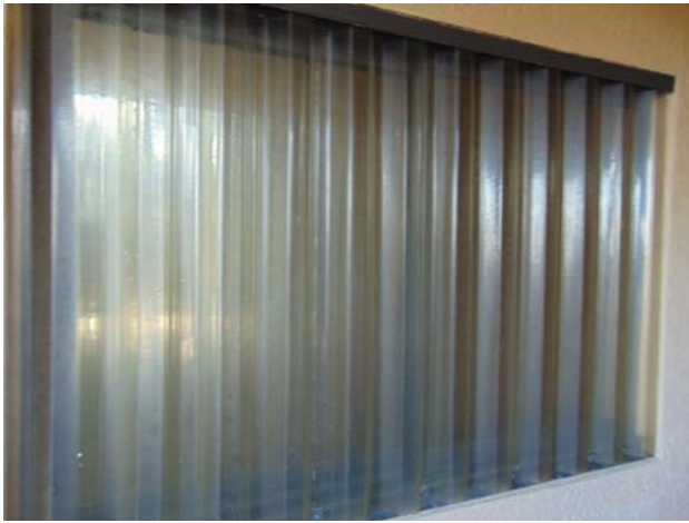
[Empty box for caption]