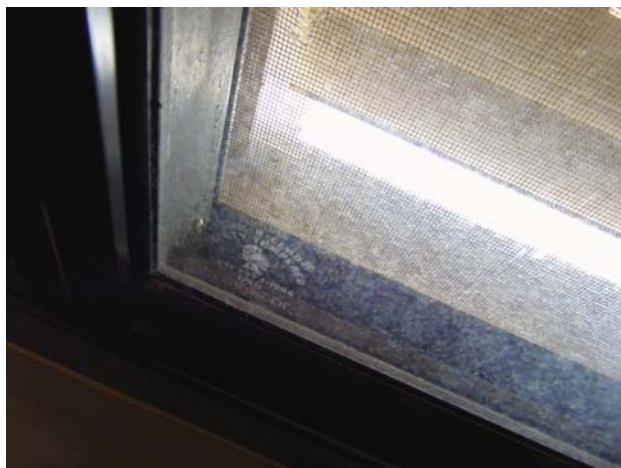
[Empty box for caption]