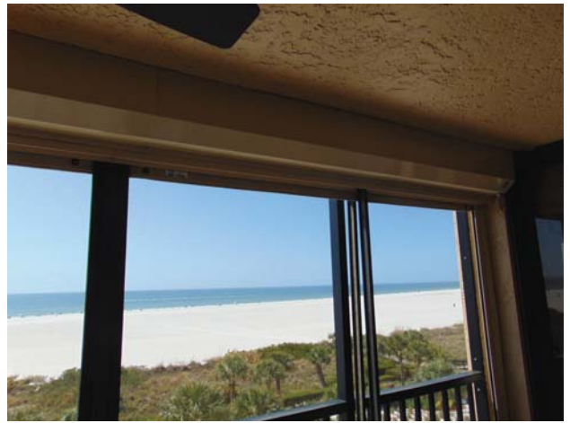
[Empty box for caption]