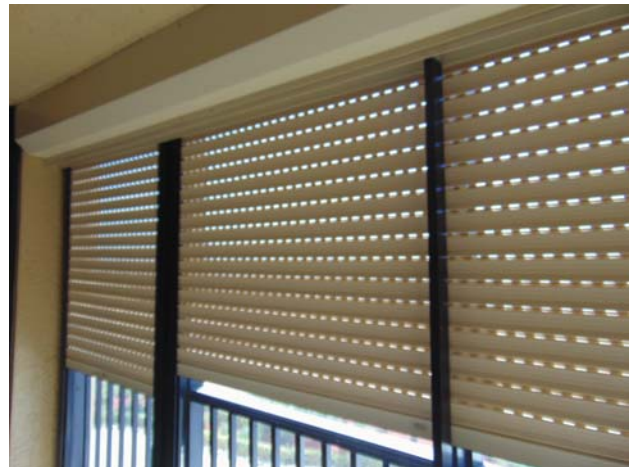
[Empty box for caption]