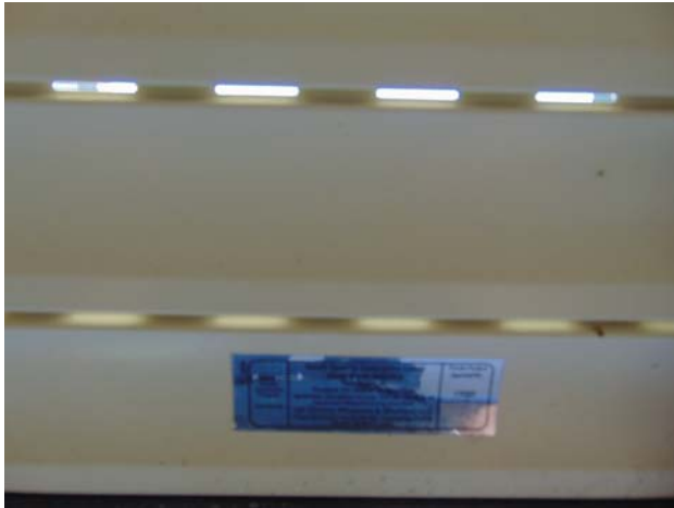
[Empty rectangular box]