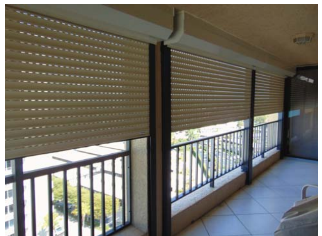
[Empty rectangular box]