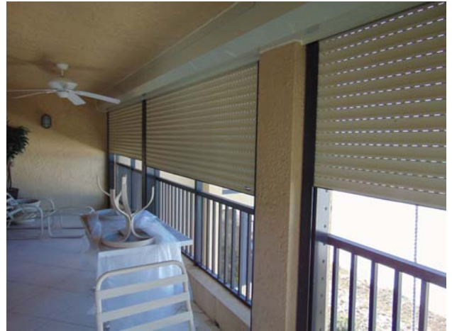
[Empty rectangular box]