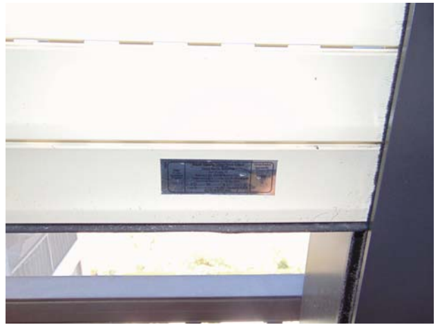
[Empty rectangular box]