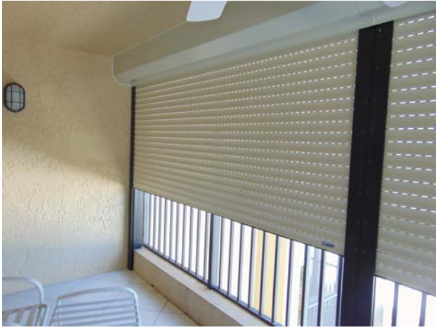
[Empty rectangular box]