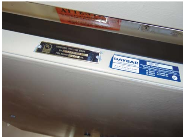
[Empty rectangular box]