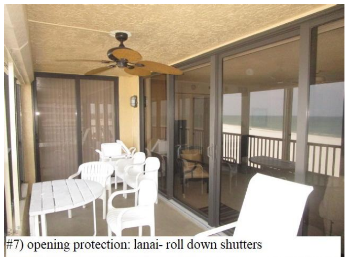
#7) opening protection: lanai- roll down shutters