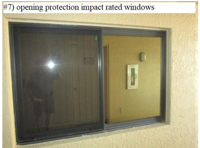
#7) opening protection impact rated windows