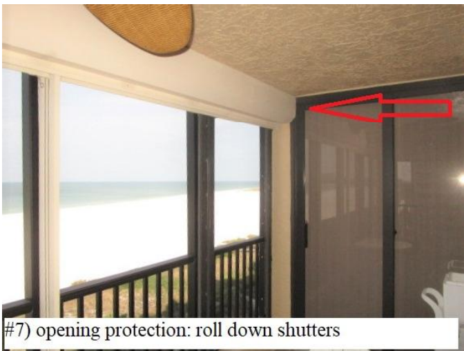
#7) opening protection: roll down shutters