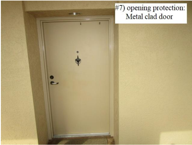
#7) opening protection: Metal clad door