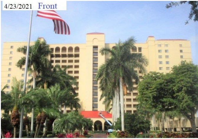
M. Schulz: 100 N Collier Blvd #801 Marco Island built 1990