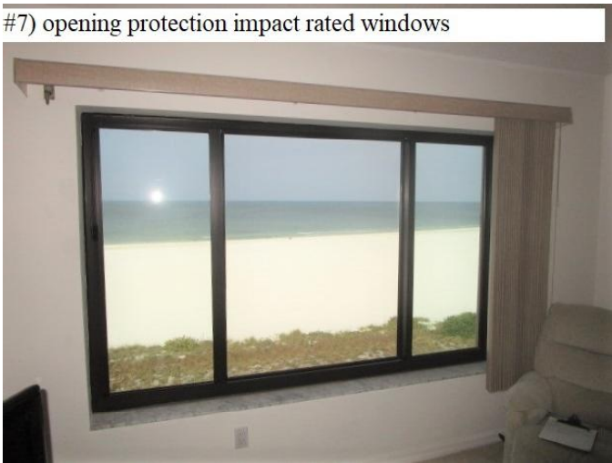
#7) opening protection impact rated windows