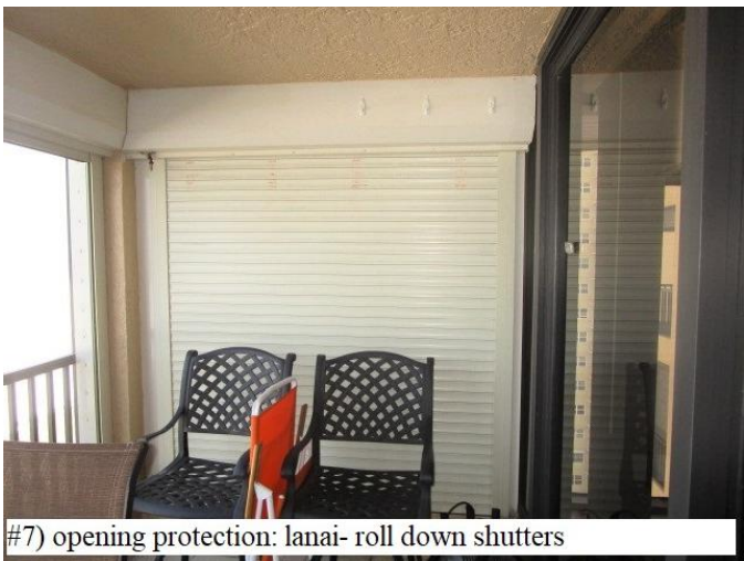
#7) opening protection: lanai- roll down shutters