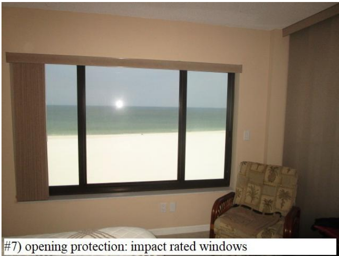
#7) opening protection: impact rated windows