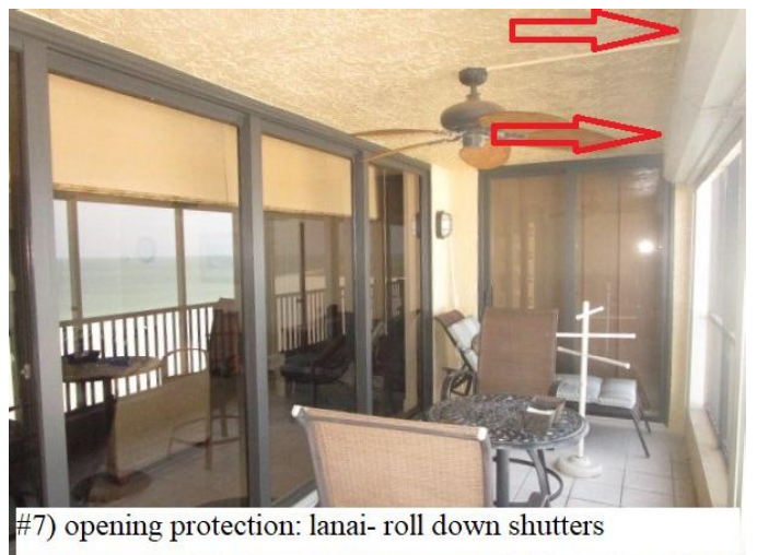
#7) opening protection: lanai- roll down shutters