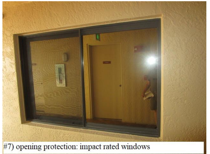
#7) opening protection: impact rated windows