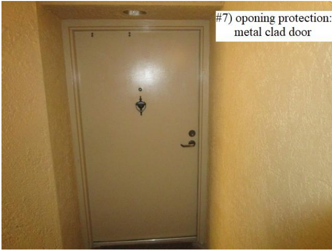
#7) opening protection: metal clad door