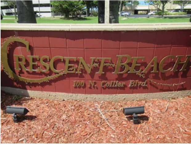
[Empty box for caption]