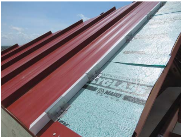
[Empty box for caption]