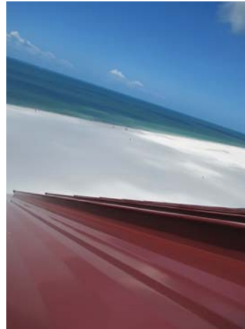
[Empty box for caption]