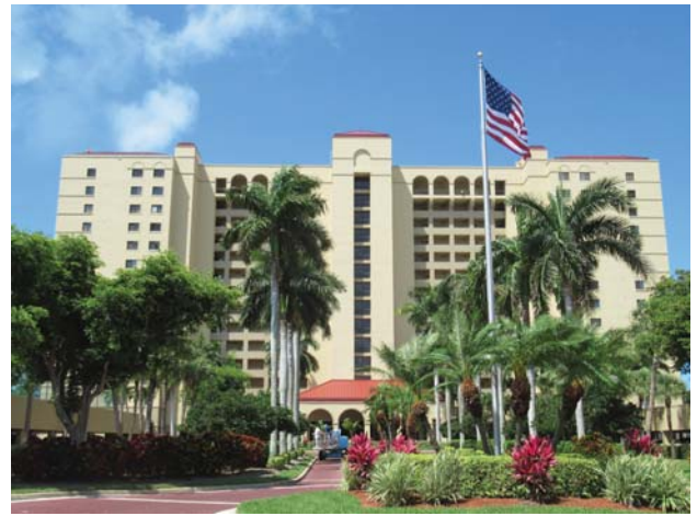
[Empty box for caption]