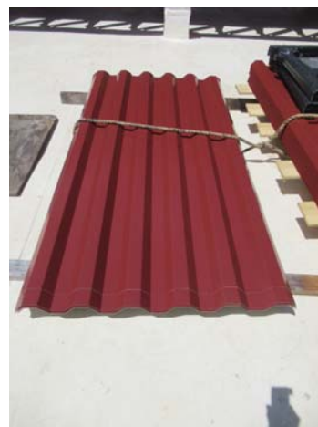
[Empty box for caption]