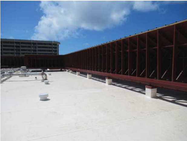
[Empty box for caption]