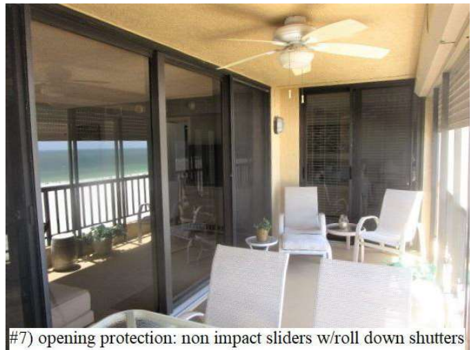
#7) opening protection: non impact sliders w/roll down shutters