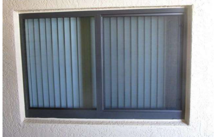
#7) opening protection: front & rear impact windows permit #WD-18-08354 applied 8/21/2018