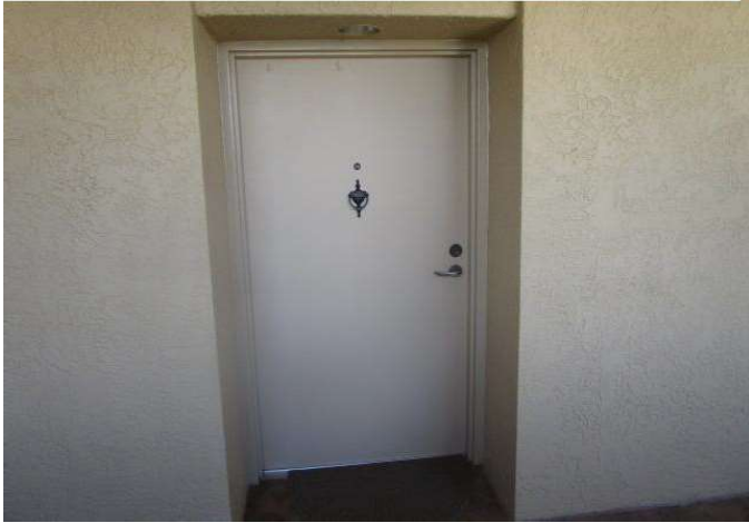
#7) opening protection: metal clad front door