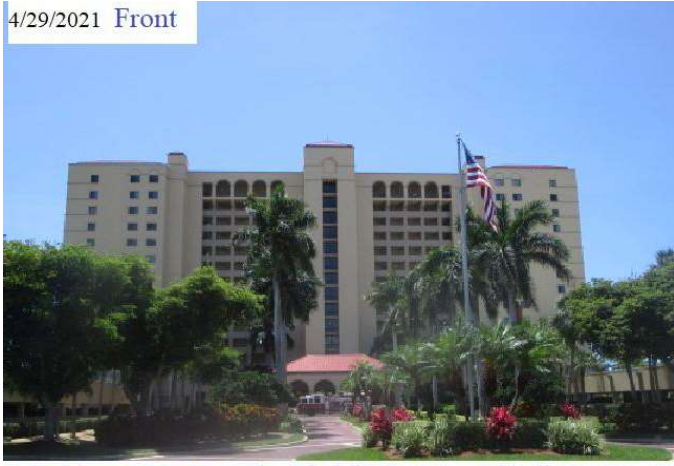
J. Parkinson: 100 N Collier Blvd #905 Marco Isl built 1990