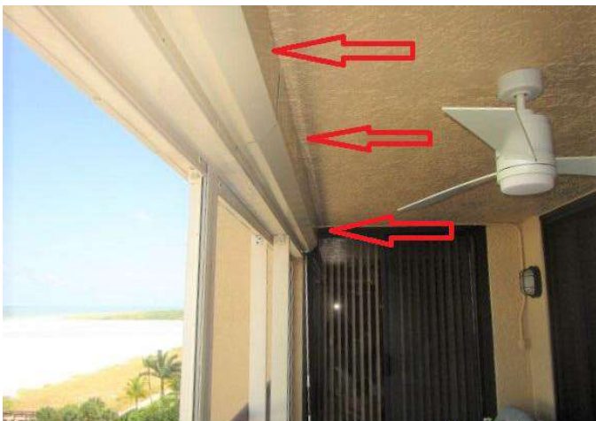
#7) opening protection: non impact rear sliders w/roll down shutters