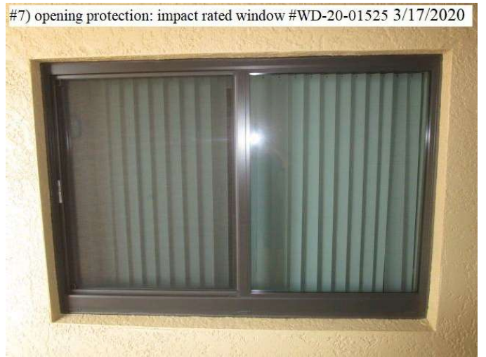
#7) opening protection: impact rated window #WD-20-01525 3/17/2020