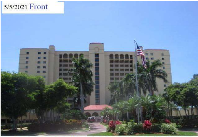
S. Aaron: 100 N Collier Blvd #703 Marco Isl built 1990