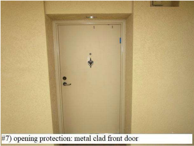
#7) opening protection: metal clad front door