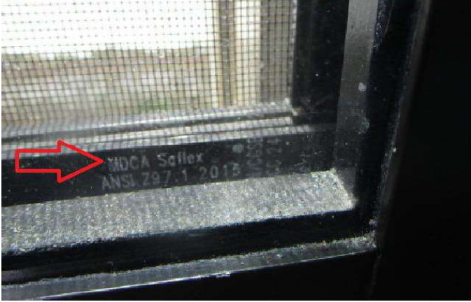
#7) opening protection: impact rated window mfg watermark MDCA=mia-dade county approved